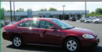
2011 Malibu LS $23,025