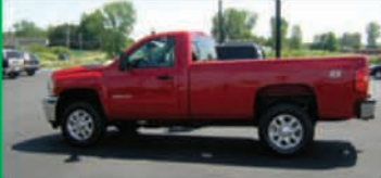
2011 Silverado $38,060