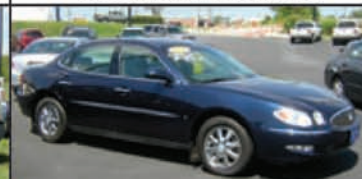
2006 Buick LaCrosse 4 dr. CXS, auto, A/C, alloy wheels, low miles 34K. Nice car. Save! $15,995.