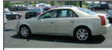
2007 Cadillac CTS , 3.6 auto, leather moon roof. Low miles 29K. Save! $22,995.