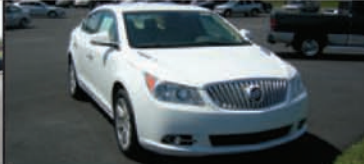
2010 Buick LaCrosse $30,880

Stop by and talk to Ron Lee about new and pre-owned cars, trucks & SUVs that are priced to sell! Rates as low as 1.9% on certified used models, no payments for 90 days. 0% financing (up to 72 months) on 2010 models with rebates as high as $5,000. All trade-ins accepted.