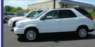
2007 Buick Rendezvous 2 WD, 4 door wagon CX, auto, A/C, 3rd row. 39,572 miles. Save! $17,995.