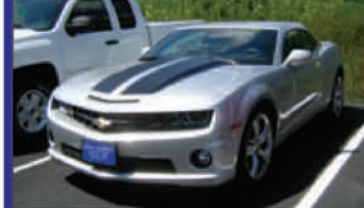
2010 Camaro SS Coupe , 6 speed, V8, like new, 100K driver warranty. Only 5,930 miles. Save today! $33,395.