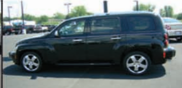
2010 HHR $25,510