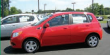
2010 AVEO $16,145