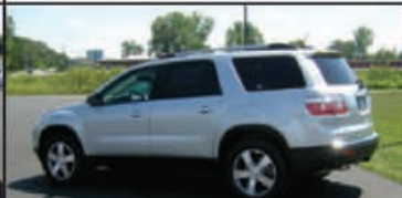
2010 GMC Arcadia $37,660