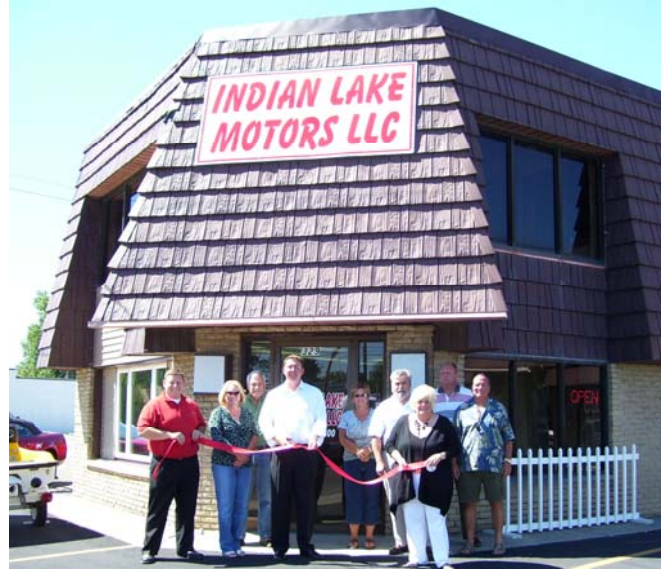
INDIAN LAKE MOTORS RIBBON CUTTING