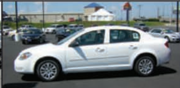
2010 Impala $26,500