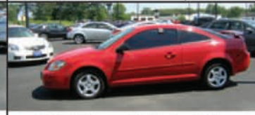
2008 Chevy Cobalt 2 door coupe LS. Auto, air, 61K. $9,995.