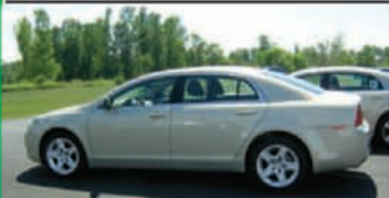
2010 Cobalt $15,595