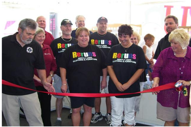
RERUNS RIBBON CUTTING