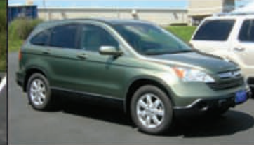
2009 Honda CRV EXL . Auto, leather, alloy wheels. 13,672 miles. Balance factory warranty. $26,995.