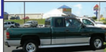
2001 Dodge Ram 1500. 2 WD, quad cab SLT, auto, air, 2 WD, alloy wheels, tow pkg., Low miles 56K. One owner. $9,495.