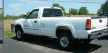
2003 GMC Sierra 2500 HD, auto, A/C, V8, 4x4, new tires. 79K miles. Nice work truck. $13,995.