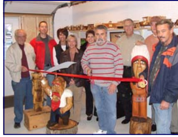
The Wood Shed - part of Framing by Fuller