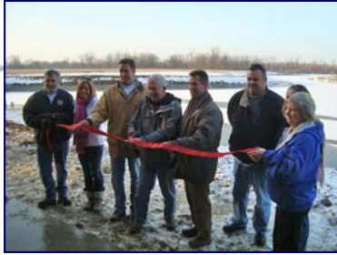
Longview Cove and opening of the channel